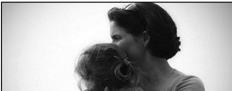
Report "The Price of Austerity – The impact on women's rights and gender equality in Europe" (2012)