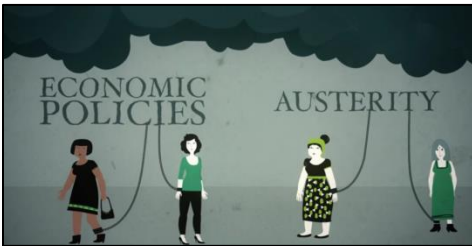
EWL clip "A she-(re) session" - What does austerity mean for women in Europe?" (2013)