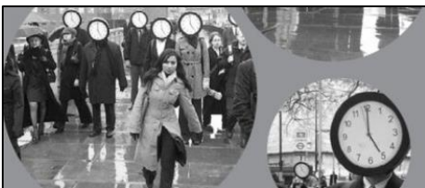
Report "Ticking Clocks - Alternative 2012 Country-Specific Recommendations to strengthen women's rights and gender equality in the Europe 2020 Strategy" (2012)